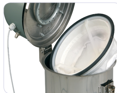
Easy to service